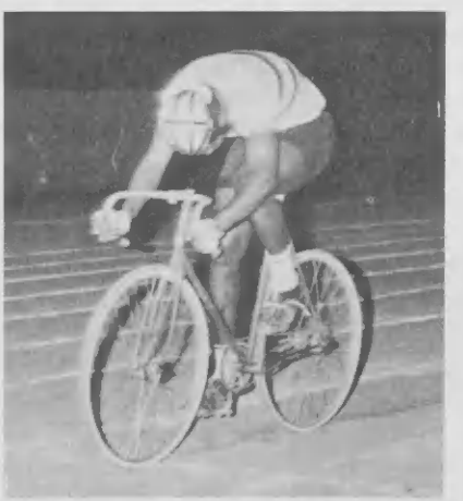
Sportsman of the Year Curlingford